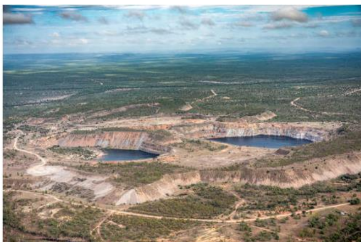
The former mining pits that form part of the Kidston Pumped Storage Hydro Project which is being developed by Trust holding Genex Power Limited.