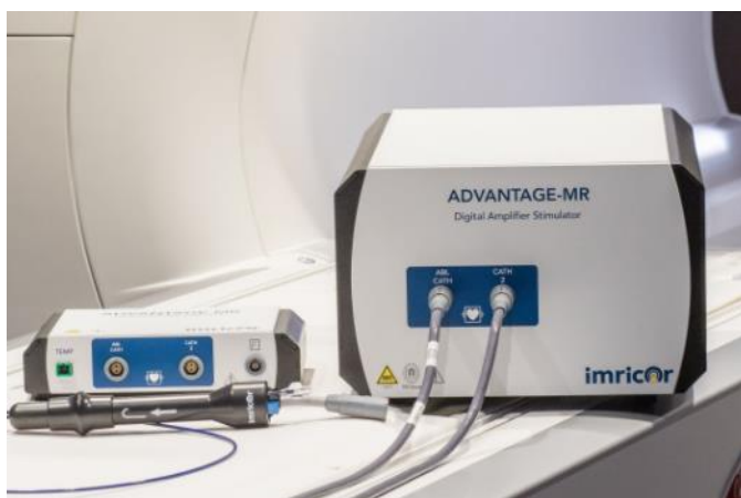
Imricor MRI-compatible cardiac catheter