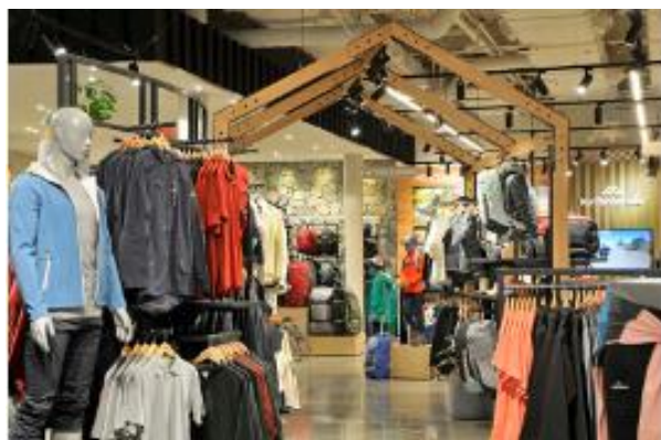
Kathmandu is now a certified B Corporation